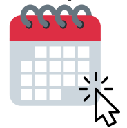
2023 Animal Project Dates